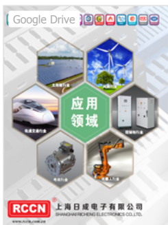
Hot Sale Catalogue