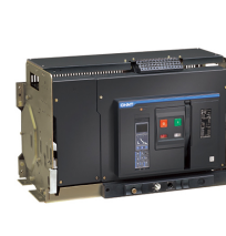
NXA series universal cir... universal circuit breaker