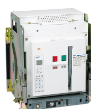
NA8G series universal c... Universal circuit breaker