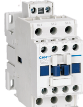
NC8 AC contactor contactor