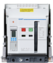
NA8 series universal cir... High breaking, zero arcing, in...